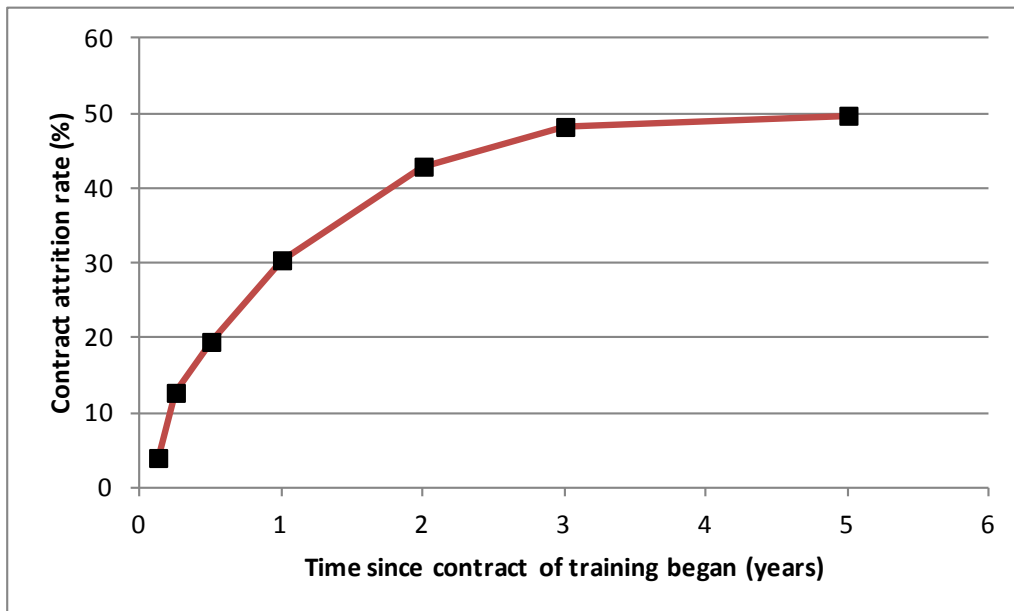
Figure 3 Contract attrition rate 1 by time of cancellation/withdrawal, for contracts commencing in 2006 (trade occupations 2 )

Notes: 1 Contract attrition rates are derived for contracts of training for apprentices and trainees. If an individual commenced two or more contracts in the same year, each is counted separately. Contract attrition rates do not take into account continuing contracts or expired contracts, where the outcome is unknown.