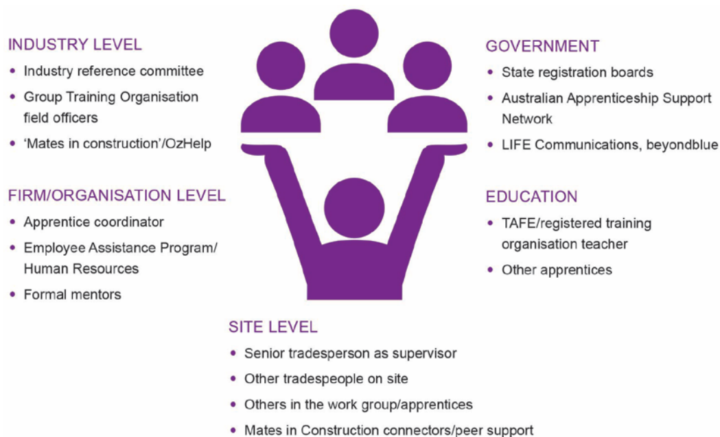
Figure 2 Dimensions of support surrounding carpentry apprentices in the organisations studied

Several of those interviewed noted that educators, especially TAFE teachers, often played a caring role beyond that of formal learning. The source of support most commonly identified was related to apprentices' status as paid workers. At the most immediate level this concerned the seasoned tradesperson as their formal supervisor. Just as importantly, it often involved other tradespeople – either fellow employees or subbies (and this included tradespeople beyond that of carpentry). Agents operating at enterprise level, such those in human resources and apprenticeship coordinators, were also valued by many of the apprentices interviewed. And beyond the enterprise, support was reported from group training organisation field officers and organisations such as OzHelp. Overwhelmingly, it was the support associated with their being embedded in the labour market that was consistently noted as being of most value to apprentices. In a nutshell, evidence of a supportive culture of craft was extensive amongst the apprentices and all those involved in developing them interviewed for this study. Members of the craft (and allied trades) often actively helped to support new entrants to navigate both changes in the life course, as well as the transition from novice to fully qualified carpenter.